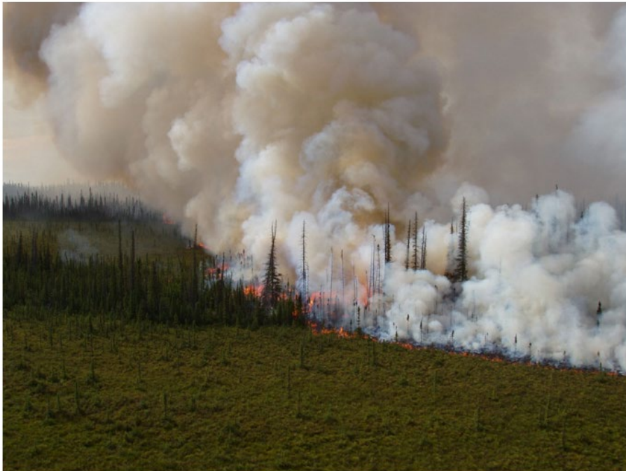
USFWS Tetlin NWR, 2003